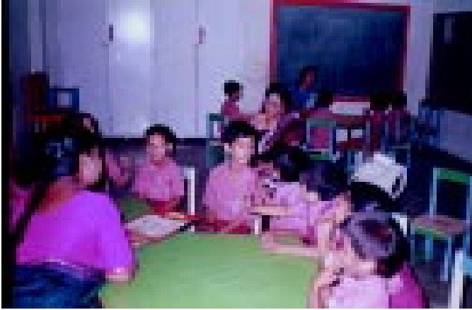
Students at Clarke School