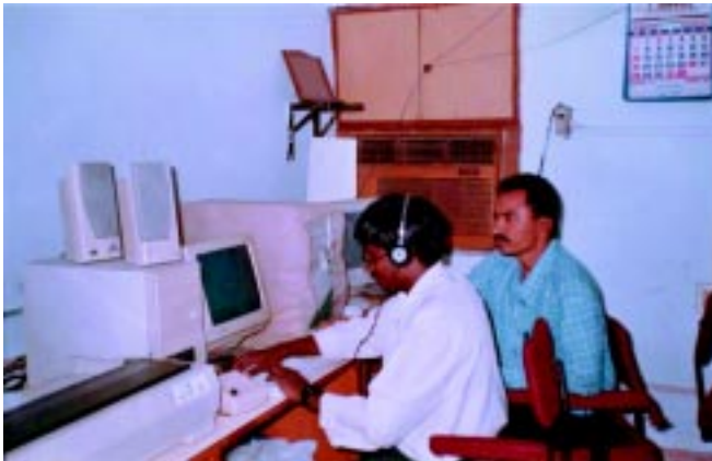
The computer center for the visually impaired at BPA

India. Presently, the Center is imparting training to the visually impaired and other differently abled in the assembly of antennae, production of communication components and other electronic items.