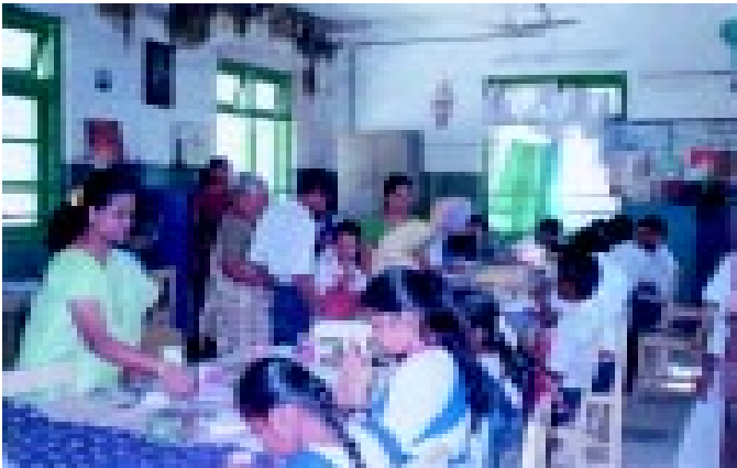
Vocational Training being imparted at Jai Vakeel School

Referring to the Vocational Training and Rehabilitation Center, Mrs Shroff says there are approximately 250 boys and girls for ‘open’, ‘sheltered’ and ‘home’ employment. “When choosing an occupation for students, care is taken to identify a suitable field in which the student is comfortable,” she says, “Since 1992, pre-vocational training and personality development program have been implemented in a big way.”