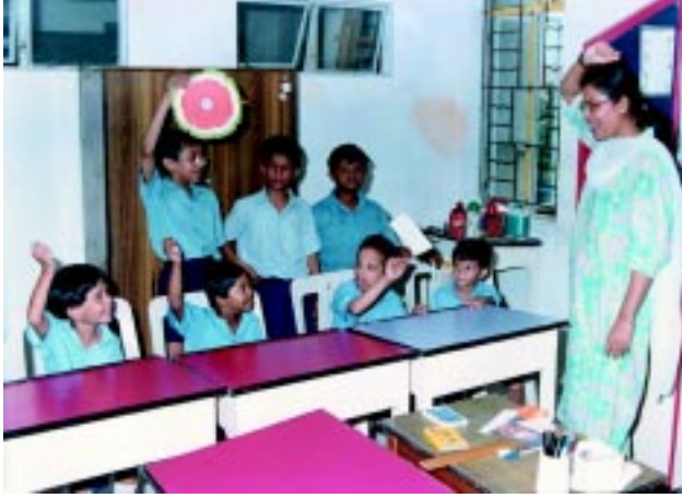
Children of Manovikas Kendra