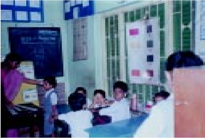
Students at SHIRC, Kolkata