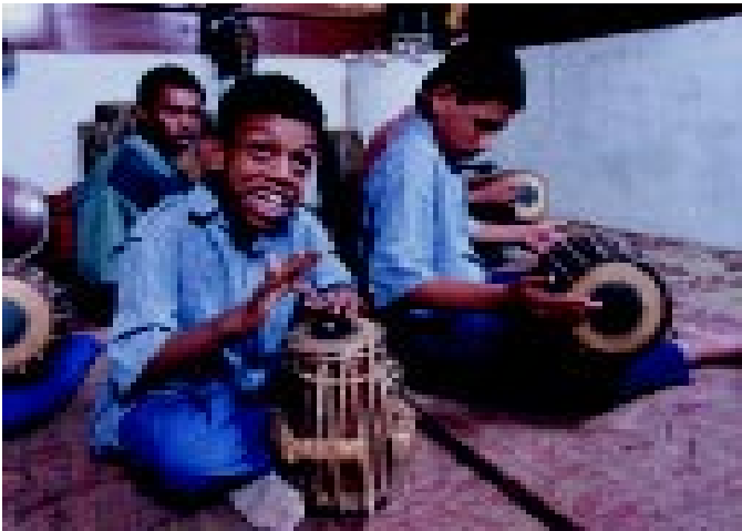
Children learning skillsets at THPI