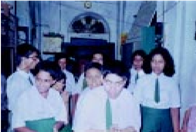
Inmates at Anuradha, Kolkata