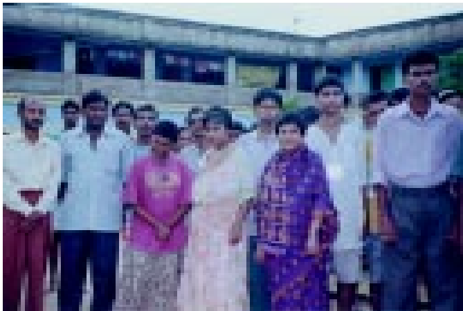
Inmates at the Murshidabad Branch