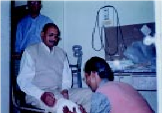
Measurement for Jaipur Foot being taken from a patient