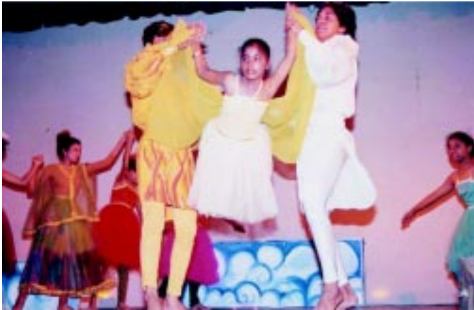
Children of Jai Vakeel School performing dance drama

“Today there are more than 400 students at the School. In academics, there are pre-nursery, nursery, pre-primary and primary and higher education sections. The school provides pre-vocational training and personality development, arts and crafts, sports. The psychosocial activities include parent counseling, home visits and gardening,” says Mrs Shroff.