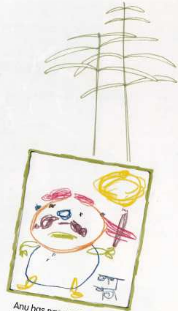
Anu has named Tuti's dad's drawing "Gabroo, the wrestler"

If he wears a pleated turban and carries a giant club on his shoulder, he'll look just great!