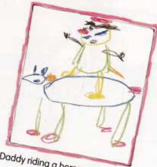
Daddy riding a horse going to war