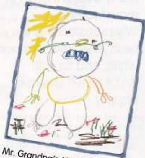
Mr. Grandpa's Mo-cloud

But Grandpa who lives next door has the best moustache of all! It looks as if a big white cloud has come down from the sky to live under his nose! His mouth is hidden behind the cloud. Anu is anxious about Grandpa... how can he eat with that cloud in the way?